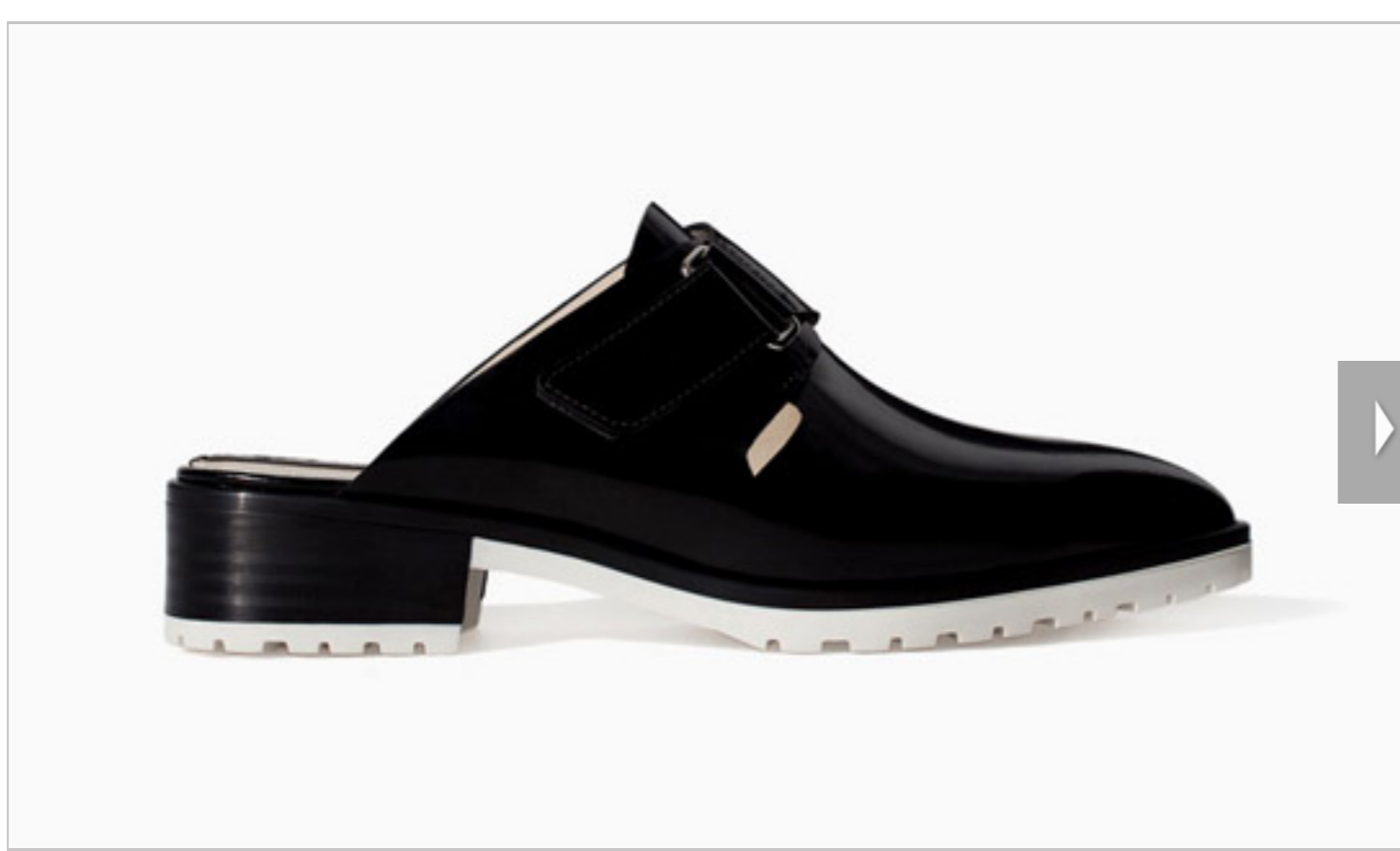
Slingback Leather Track Shoe, $129 at Zara stores, and online.

While I have never felt trapped in a pair of high heels, after years of wearing them day in and day out, I now feel a pull towards its antithesis. Perhaps it's the fatigue of having relegated a glamorous shoe to everyday wear, or the desire for light, airy sartorial fare to match the season—and the current, or simply not wanting to ruin any more heels in Montreal's pothole-infested streets. In any case, flats, the latter of which seldom matched the elegance of a pair of heels before now, pack a stylish punch that almost rivals that of the classic high heel shoe. Almost, because nothing quite compares to a high heel. But the flats on offer this season, from sneakers to slip-on shoes, slingbacks, loafers, sandals and espadrilles—complete with luxe prints, rich colours and finishes, and playful embellishments—err more on the side of fab than drab, making them a surprisingly ideal, albeit quirky, match for our fancy ensembles.