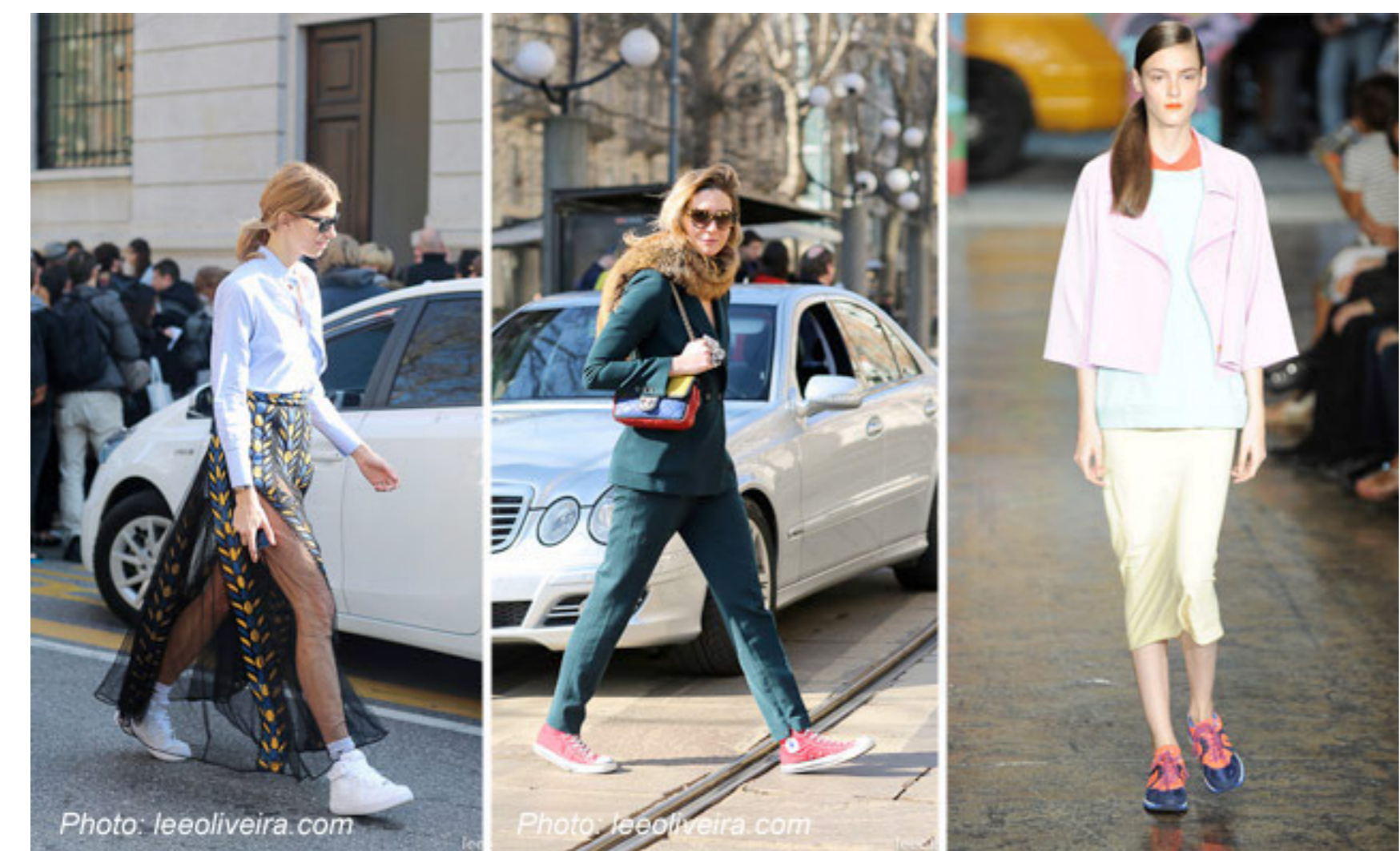
Sneakerheads, from left to right: street style looks outside the shows in Milan, and a look from the DKNY Spring 2014 fashion show during Mercedes-Benz Fashion Week.

I'm a die-hard fan of the high heel shoe. I began sporting high heels long before I started wearing makeup. Over the past few years, I've seldom worn flats, so much so that when I do descend from atop my pumps and stilettos and slip on something closer to the ground, the people that know me best are greatly concerned. They fathom that I must not be well to do something so out of character. That is the extent to which heels have become a part of my sartorial aesthetic.