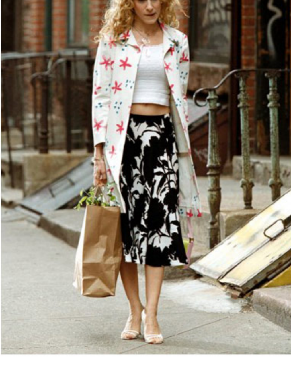
Sarah Jessica Parker as Carrie Bradshaw working those mules in Sex and the City (1998).