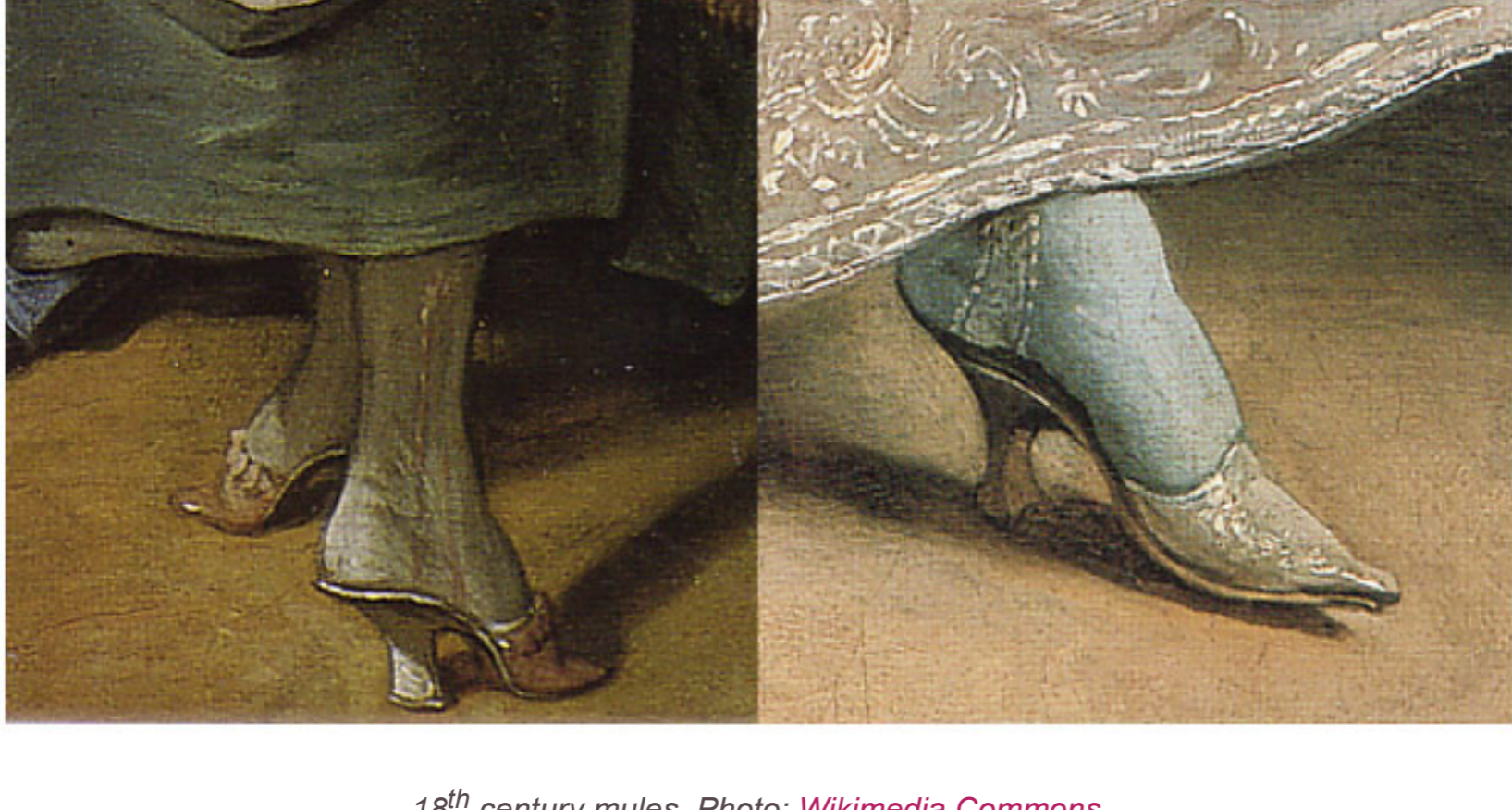
18 th century mules.

As with all past trends that have made a comeback this season, the mule is new and improved. From Altuzarra to Alexander Wang, designers have revamped the usually all-black shoe, adding colour, texture and architecture to mules, resulting in a fresh and feminine offering, far removed from the masculine and clunky Scandinavian clog that permeates the sartorial consciousness. Think snakeskin, spikes, clear straps, jewels and two-tone stiletto, chunky, and wedge heels; the mule is as sophisticated as can be. Given its many tasteful incarnations, it's difficult to imagine why the mule still gets a bad rap, save for the balancing act it requires. The solution is simple enough: opt for a snug-fitting mule which allows for a firm grip. Better yet, go for one with a subtle strap around the back of the ankle, like slingbacks. As for that clomping sound? Mules wouldn't be the first shoes to make their wearer's presence known, hence why all the fuss? However you may feel about mules, I wager you will likely find it difficult to resist the urge to clomp, or rather clack away, as with any old pair of heels, in these unusual shoes once you see the light and elegant mules on offer this season.