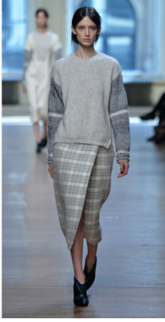
From left to right: Fall 2014 sweaters as seen on the runway at Zimmermann, Ralph Lauren and Yigal Azrouel during Mercedes-Benz Fashion Week.

As cool fall days turn to brisk autumn nights, whether crocheted, cable, Fair Isle, Aran, argyle or intarsia, the sweater is, as with every cold season, our elected sartorial go-to. Whether layered atop a crisp white shirt or worn on its own, it is the perfect enveloping piece, one we reach for almost instinctively. A seasonal classic and a perennial favourite, this season, the sweater continues to beguile with striking colours, artsy prints and warm, cozy textures. From the slouchy sweaters at The Row to the dainty fuzzy knit tops spied on the runway at Zimmermann, the sweater is like a fine wine; it only gets better with age.