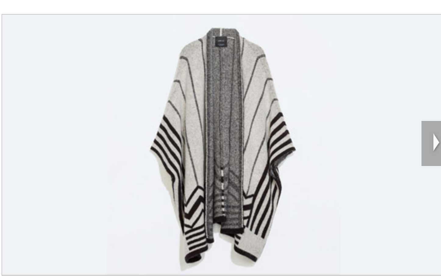
Intarsia Poncho Cardigan, $79.90 at Zara stores, and online.

Now, on to some sweater inspiration as you stock up on the knitted classic for fall: