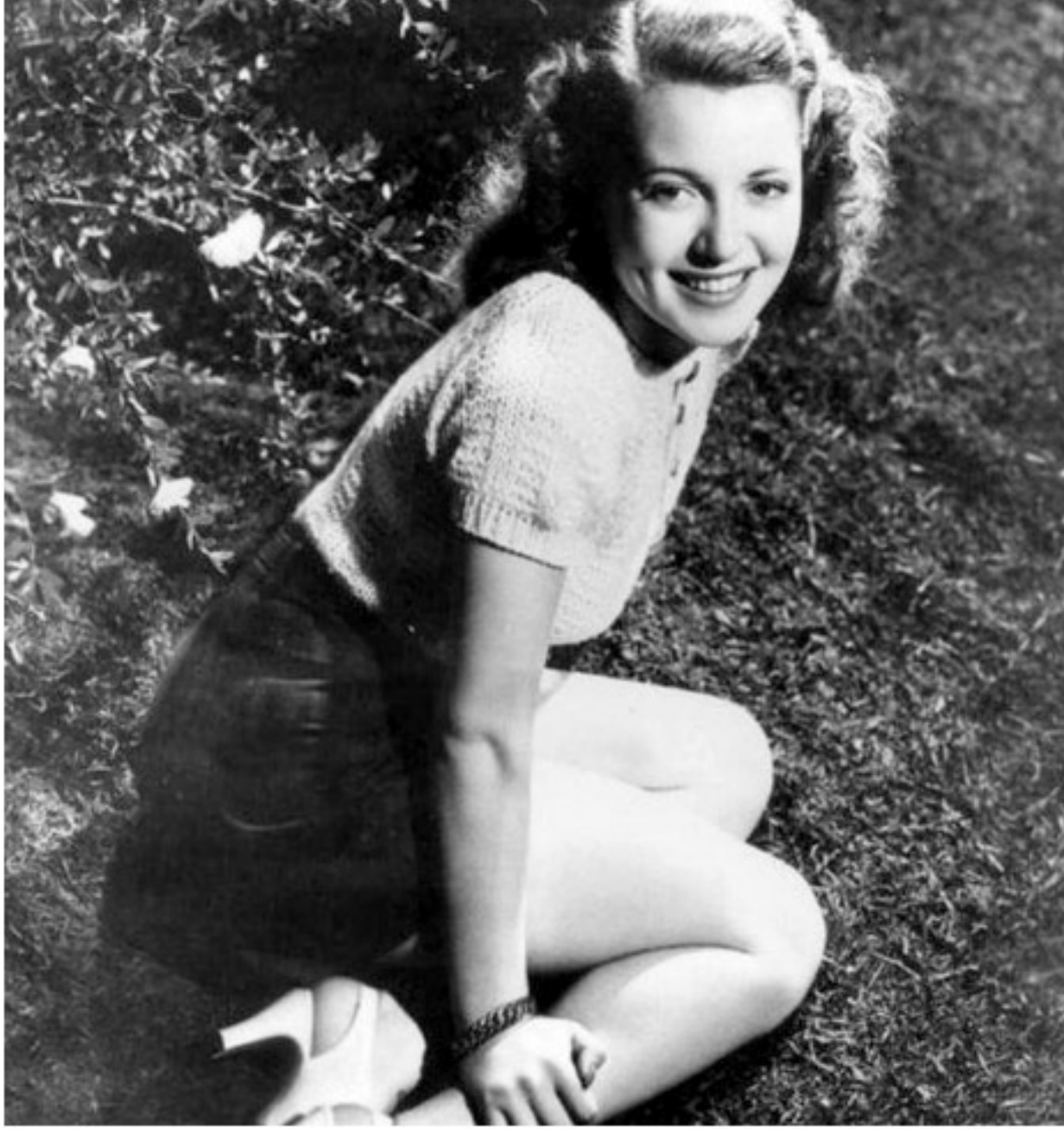
Actress Lana Turner, the original "sweater girl".

Originally fashioned out of natural wool and worn by fishermen and sailors to guard against the cold, the sweater has evolved into the fall garment par excellence for looking stylish all the while keeping warm. Our fashion columnist traces the history of this sartorial classic.