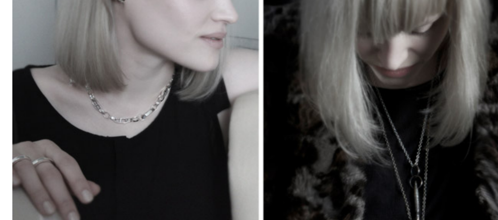
Left: Model wears Helm Choker, silver Obelisk Ear Cuff and S-Ring. Right: Model wears Peg Necklace. LACAR Jewelry Fall 2014 lookbook